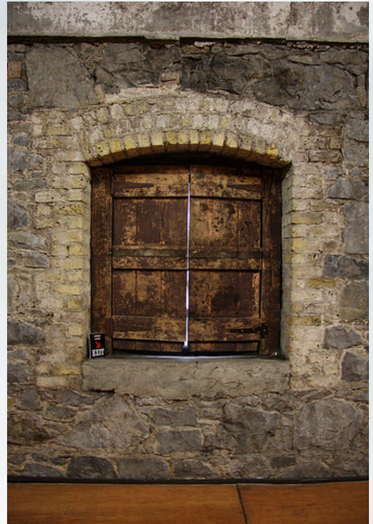
Photo number two was taken in a whiskey museum. I know that opacity means that light is not allowed to pass and that is showed in the photograph. It blocks the light from the window. There was lack of light in the place the picture was taken. As I had no tripod with me I had to place the ISO high enough to make it happen.

Photo number one was taken in Dublin, I walked around with the idea to find a clean window. I decided to photograph this car because the window was clean and it shows the subject “transparent” in a clear way.